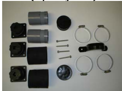
System Kit (1 per system)