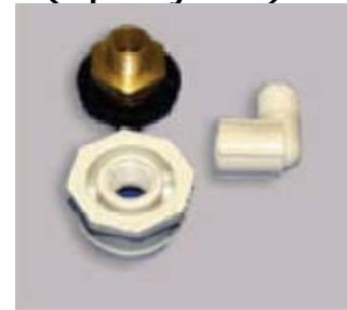
Vacuum Breaker Kit (1 per system)