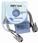
Optional isolated RS232 communication interface and VEBat software (for BMV 602 and 602H)